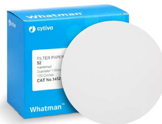
Hardened low ash quantitative filter papers