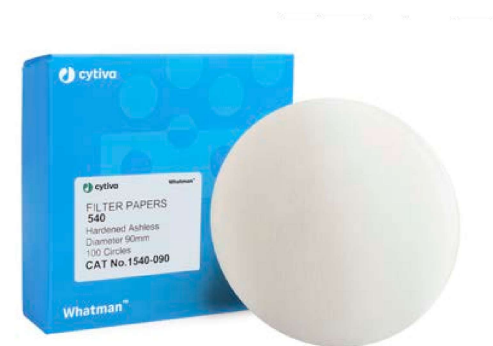
Hardened ashless quantitative filter papers, Grade 540

3 Ash is determined by ignition of the cellulose filter at 900°C in air