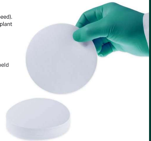
Grade 4 qualitative filter papers