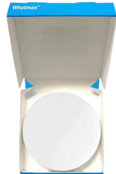
Grade 597 Optima filter papers