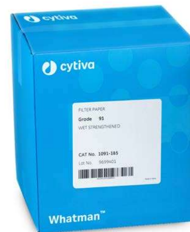
Qualitative filter papers, Grade 91