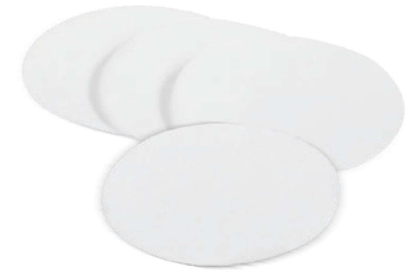
Whatman ashless quantitative filter paper circles

* Particle retention rating at 98% efficiency