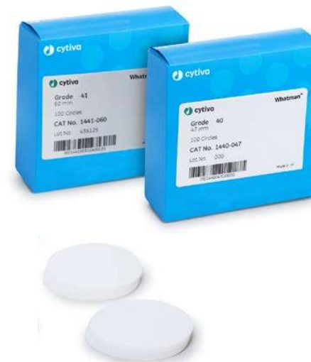
Quantitative filter papers, ashless