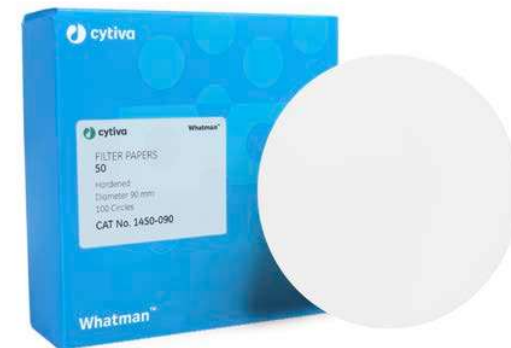
Hardened low ash quantitative filter papers

* Particle retention rating at 98% efficiency.