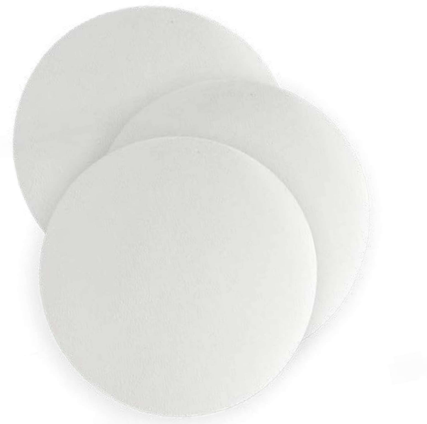
Grade 602 eh filter papers