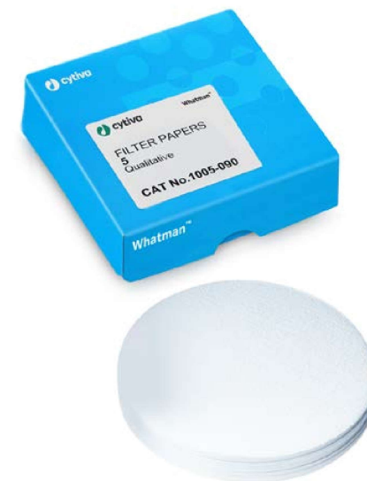
Grade 5 qualitative filter papers

Typical values for additional grades can be found in Appendix A.